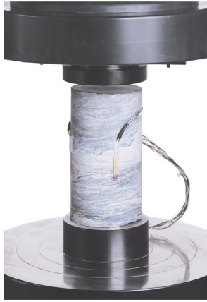
Rock sample fitted with 82-P0390 strain gauges